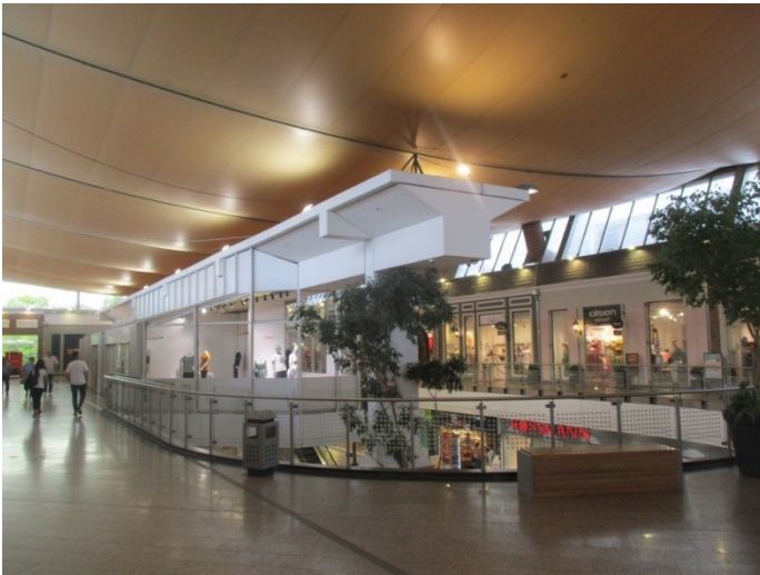
Fashion Outlet Marl, Marl (D) Outlet Evolution Services