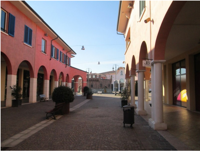
Mantova Outlet Village, Bagnolo San Vito (I) Multi Outlet Management Italy