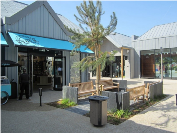
Marques Avenue A13, Aubergenville (F) Marques Avenue Group