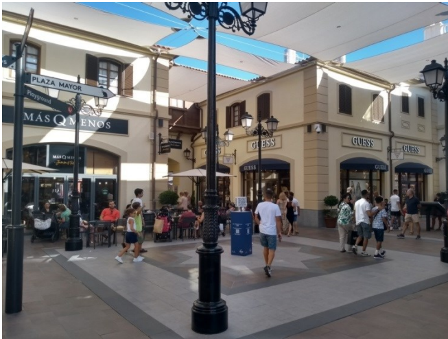
Designer Outlet Malaga, Malaga (E) McArthurGlen