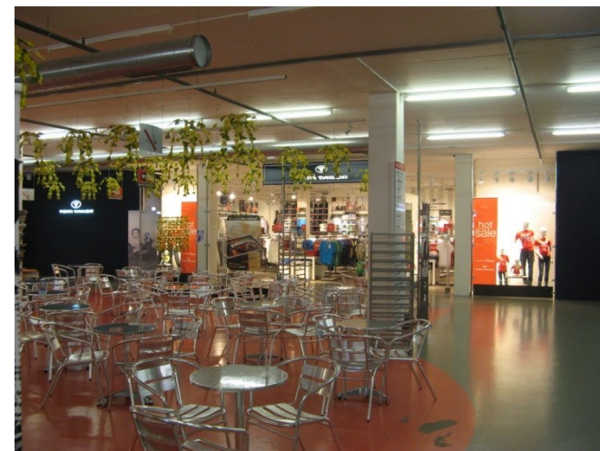
Outletpark Switzerland, Murgenthal (CH) Interdomus AG