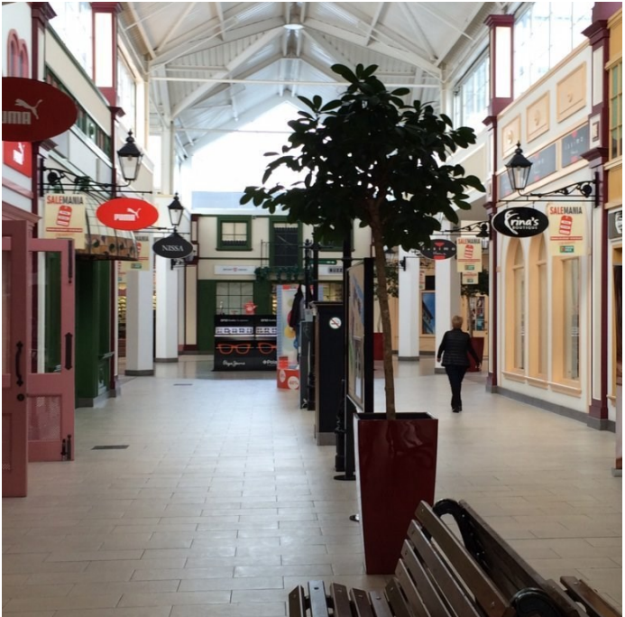
Fashion House Outlet Centre Bucharest, Bucharest (RO) Fashion House Outlet Management