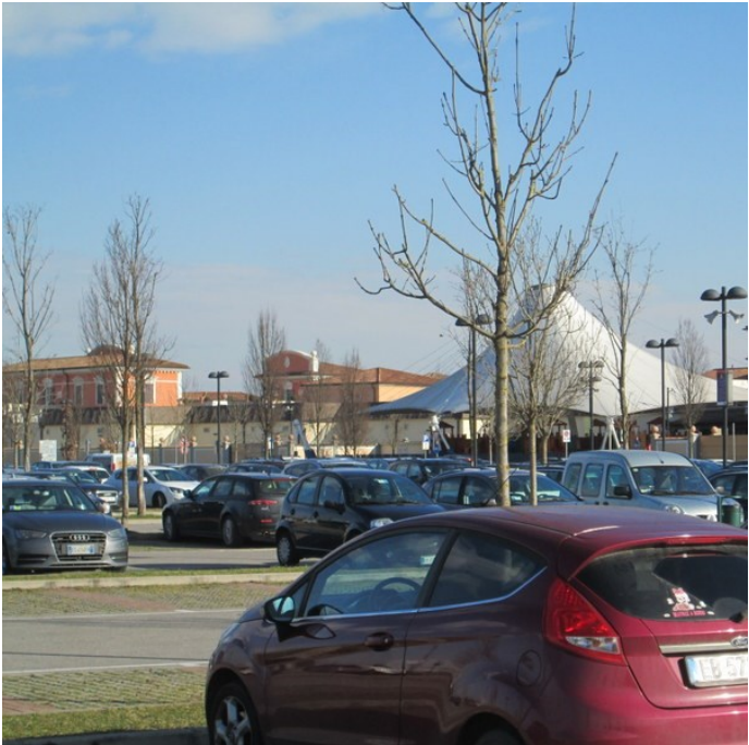
Designer Outlet Noventa, Noventa di Piave (I) McArthurGlen