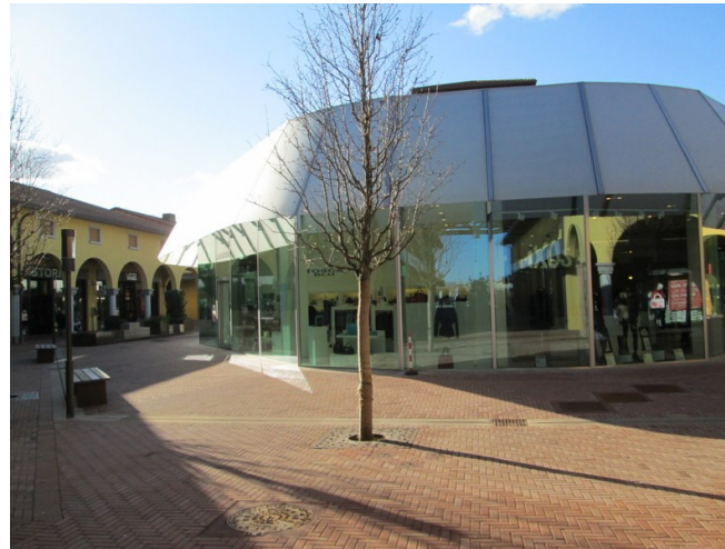
Castel Guelfo di Bologna The Style Outlets, Castel Guelfo (I) Neinver