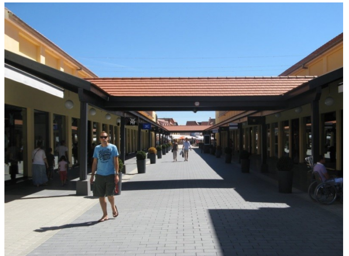
Roppenheim The Style Outlets, Roppenheim (F) Neinver