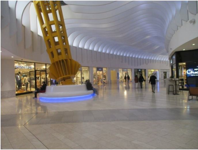
ICON Outlet at the O2, London (UK) CBRE Management