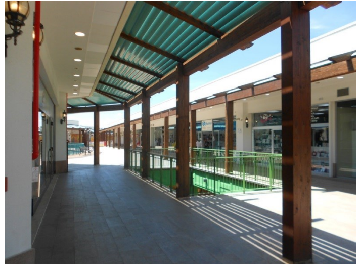
Sardinia Outlet, Sestu (I) Cogest Retail Ltd