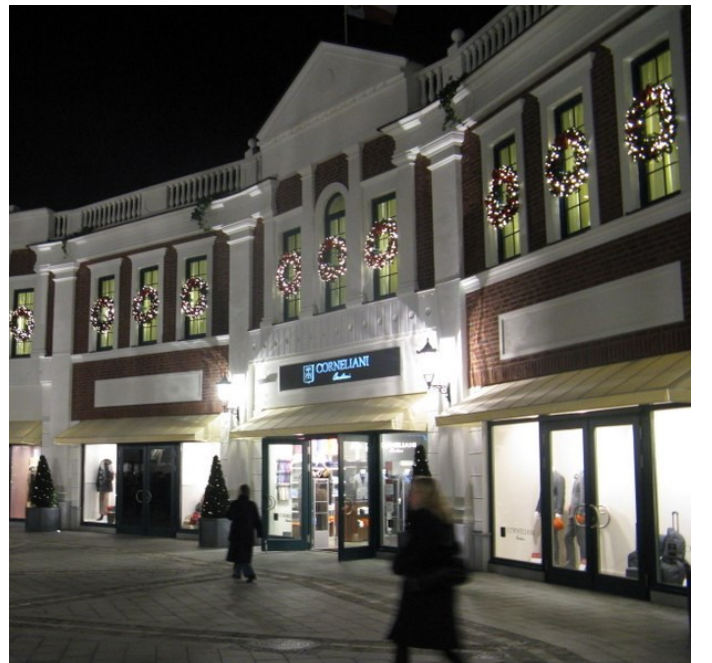
Designer Outlet Neumünster, Neumünster (D) McArthurGlen