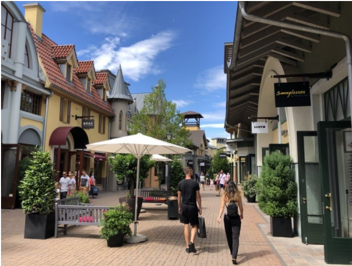
Wertheim Village, Wertheim (D) Value Retail