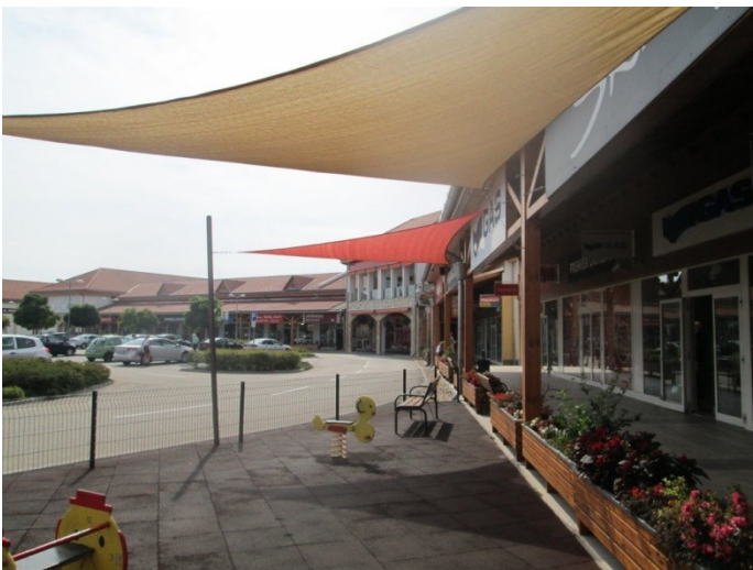
Premier Outlet Center, Biatörbágy (HU) ROS Retail Outlet Shopping