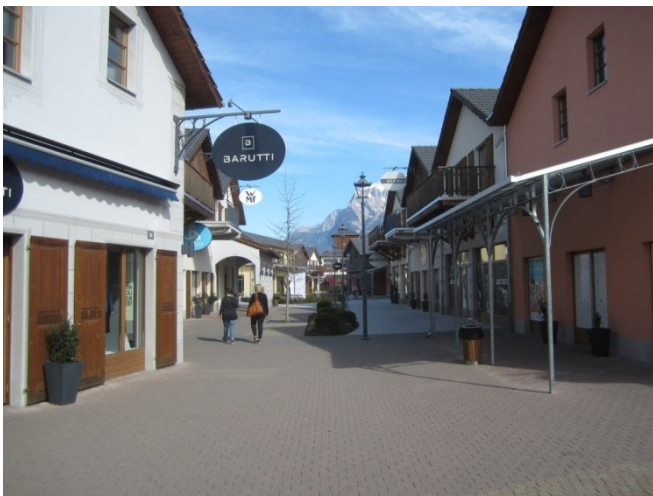
Fashion Outlet Landquart, Landquart (CH) VIA Outlets