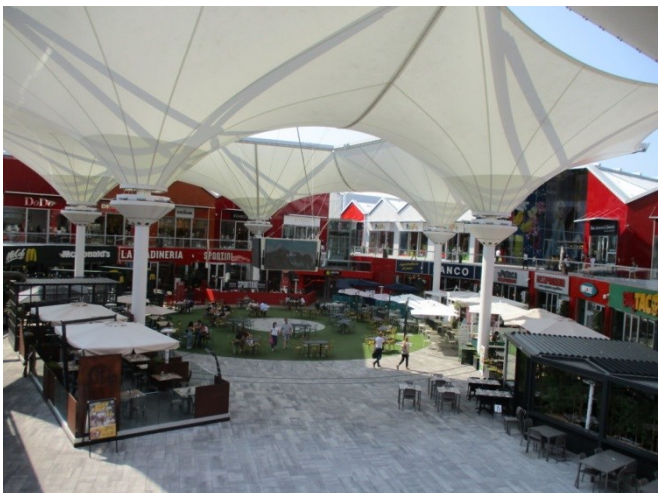
Scalo Milano Outlet & more, Locate di Triulzi (I) Locate District Spa