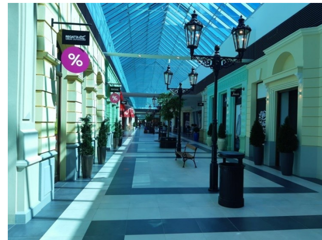
Premium Outlet Prague Airport, Ruzyně (CZ) The Prague Outlet One a.s.