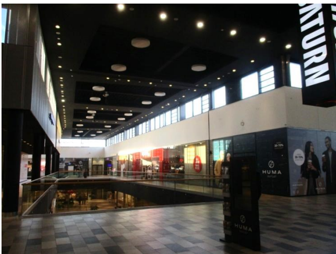
HUMA Shopping & Outlet, St. Augustin (D) Haslinger Retail Real Estate Consulting