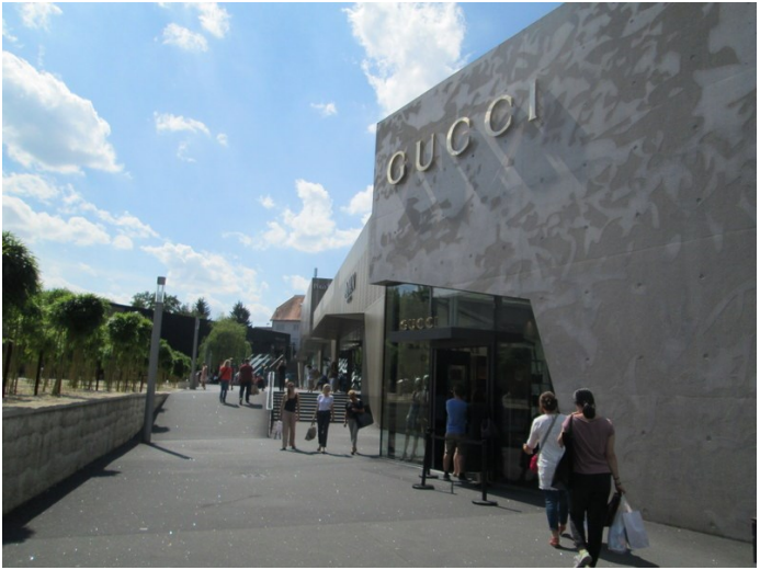
Outletcity Metzingen, Metzingen (D) Outletcity AG