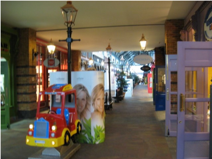
Designer Outlet Sosnowiec, Sosnowiec (PL) ROS Retail Outlet Shopping