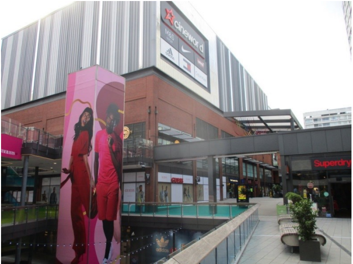
London Designer Outlet, London (UK) Realm Outlet Centre Management