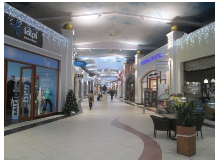
Freeport Fashion Outlet, Chvalovice (CZ) Ekazent