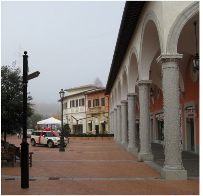
Designer Outlet Barberino, Barberino di Mugello (I) Promos