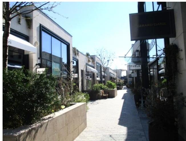
Designer Outlet Paris-Giverny, Douains (F) McArthurGlen