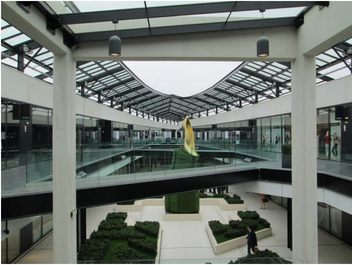
One Nation Paris, Les Clayes sous Bois (F) Catinvest