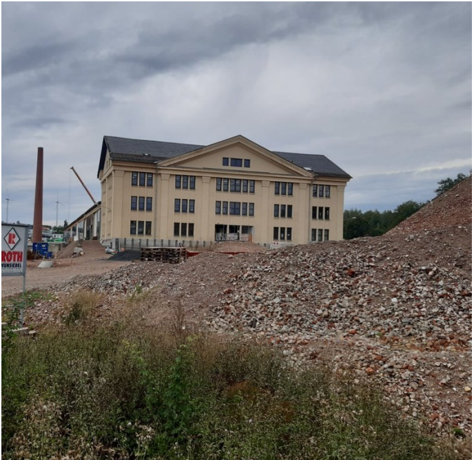
Outlet Center Selb, Selb (D) CMR Center Management Group