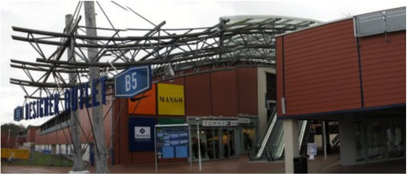
Historical Photo: B5 Designer Outlet, Wustermark (D) The buildings were demolished and replaced by the Designer Outlet Berlin, built in a village style. McArthurGlen