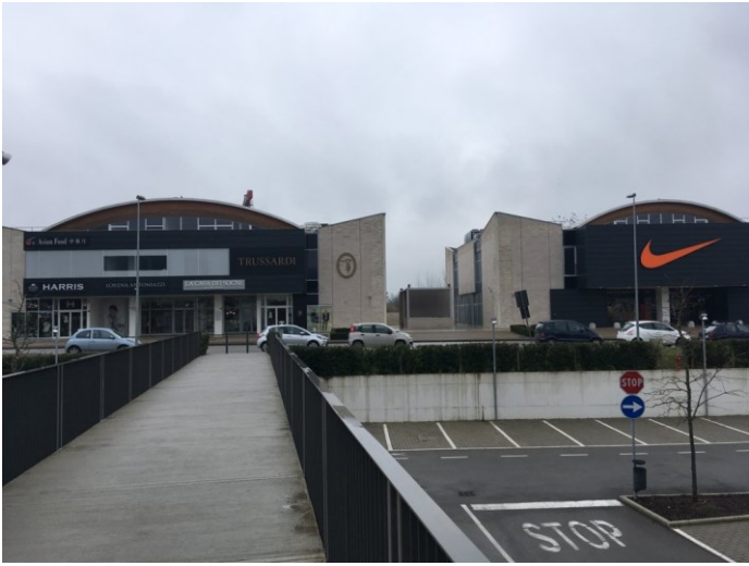
The Mall, Leccio Reggello (I) Design Management Srl