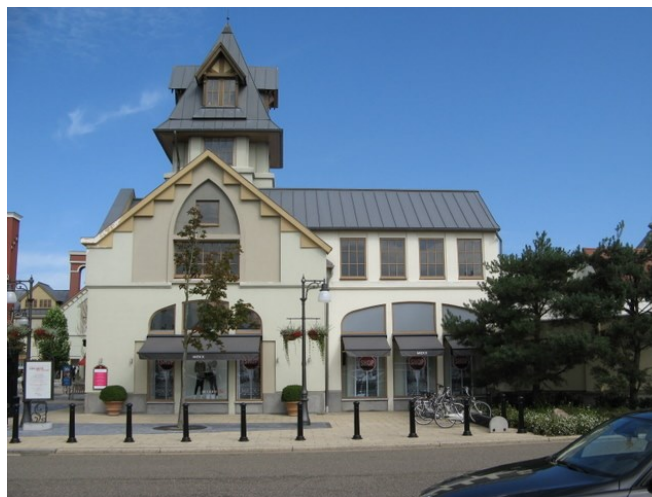
Maasmechelen Village, Maasmechelen (B) Value Retail