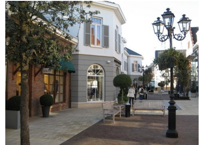
Roermond Designer Outlet, Roermond (NL) McArthurGlen