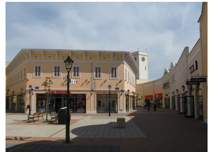
Roses Designer Outlet, Sveti Kriz Zacretje (HR) Roses Values