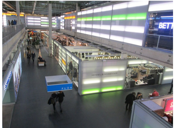
Seemaxx Outlet Center, Radolfzell (D) Kintyre Investments