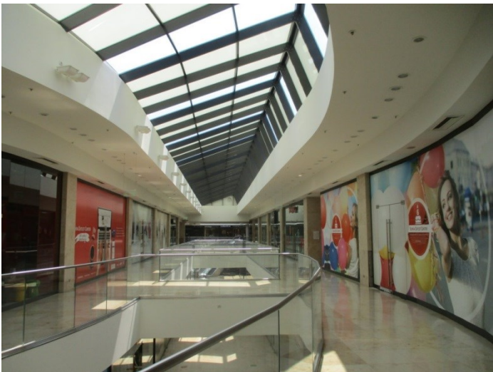
Sofia Outlet Center, Sofia (BG) Operator unknown