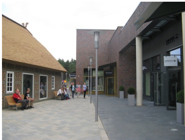
Designer Outlet Soltau, Soltau (D) ROS Retail Outlet Shopping