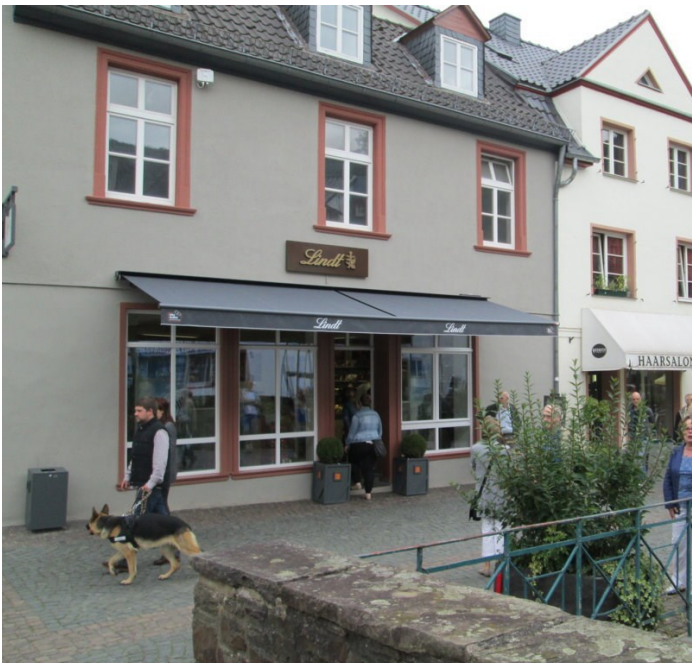
City Outlet Bad Münstereifel, Bad Münstereifel (D) City Outlet Bad Münstereifel GmbH (this picture was taken before the destruction by the flood disaster of Juli 2021)