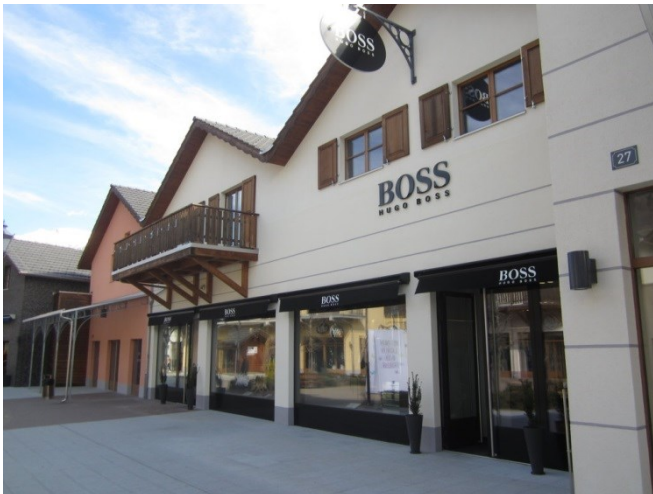
Fashion Outlet Landquart, Landquart (CH) VIA Outlets