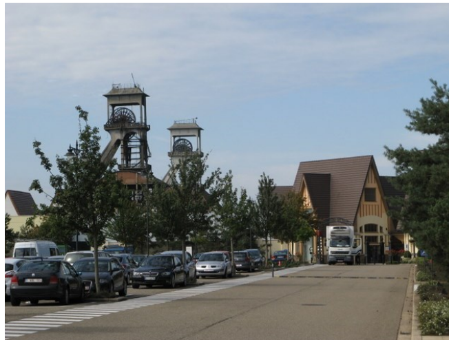
Maasmechelen Village, Maasmechelen (B) Value Retail