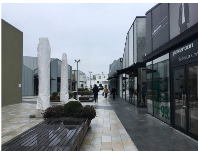
The Mall, Leccio Reggello (I) Design Management Srl