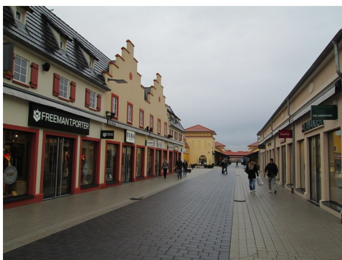
Roppenheim The Style Outlets, Roppenheim (F) Neinver