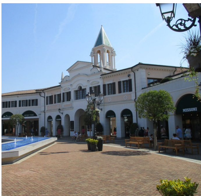
Designer Outlet Noventa, Noventa di Piave (I) McArthurGlen