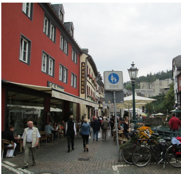
City Outlet Bad Münstereifel, Bad Münstereifel (D) City Outlet Bad Münstereifel GmbH (this picture was taken before the destruction by the flood disaster of Juli 2021)