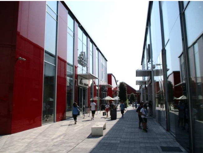
Scalo Milano Outlet & more, Locate di Triulzi (I) Locate District Spa