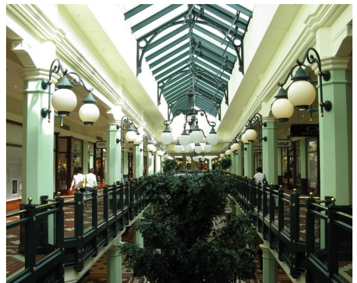
Designer Outlet Salzburg, Wals-Siezenheim (A) McArthurGlen