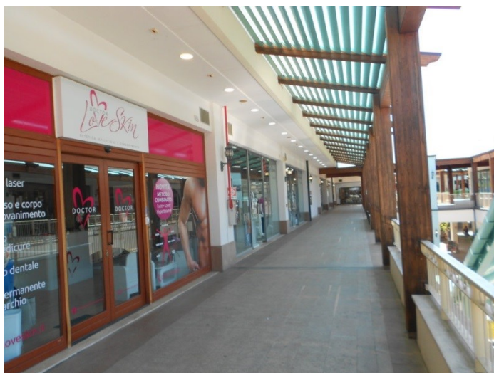
Sardinia Outlet, Sestu (I) Cogest Retail Ltd