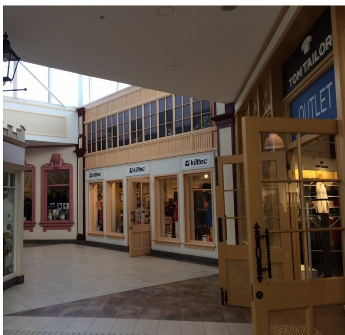
Fashion House Outlet Centre Bucharest, Bucharest (RO) Fashion House Outlet Management