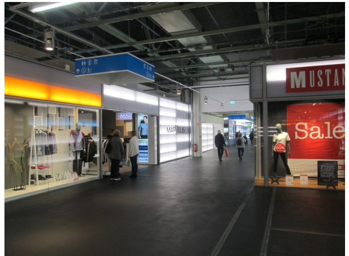
Seemaxx Outlet Center, Radolfzell (D) Kintyre Investments