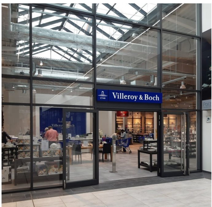
Outlet Center Selb, Selb (D) CMR Center Management Group