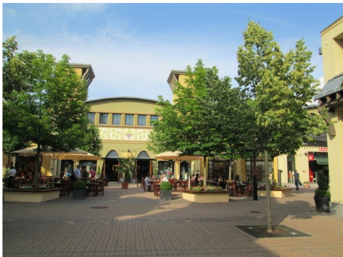
Wertheim Village, Wertheim (D) Value Retail