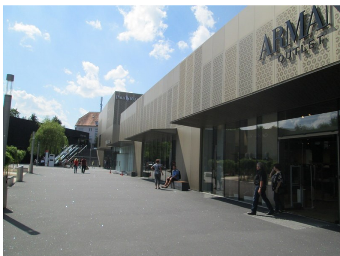
Outletcity Metzingen, Metzingen (D) Outletcity AG