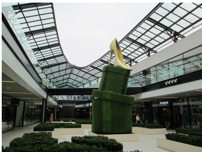
One Nation Paris, Les Clayes sous Bois (F) Catinvest