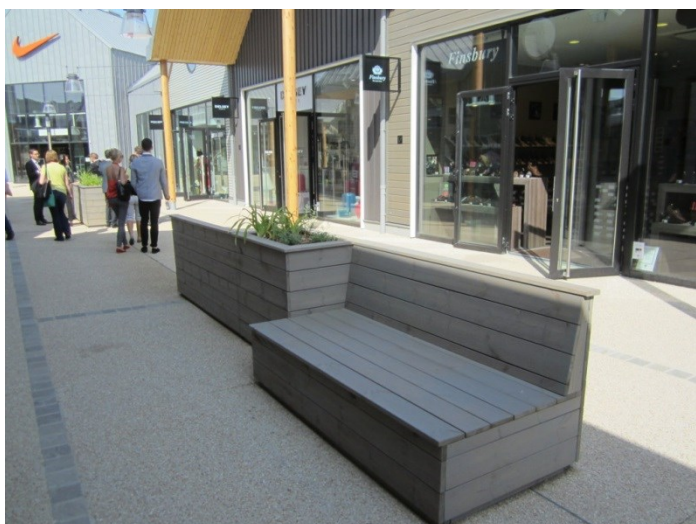
Marques Avenue A13, Aubergenville (F) Marques Avenue Group