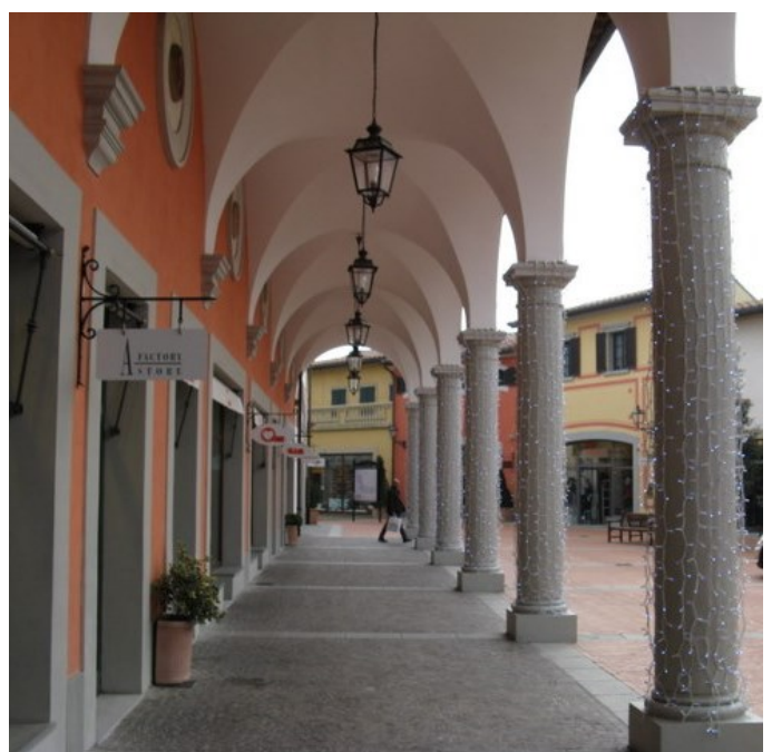
Designer Outlet Barberino, Barberino di Mugello (I) Promos