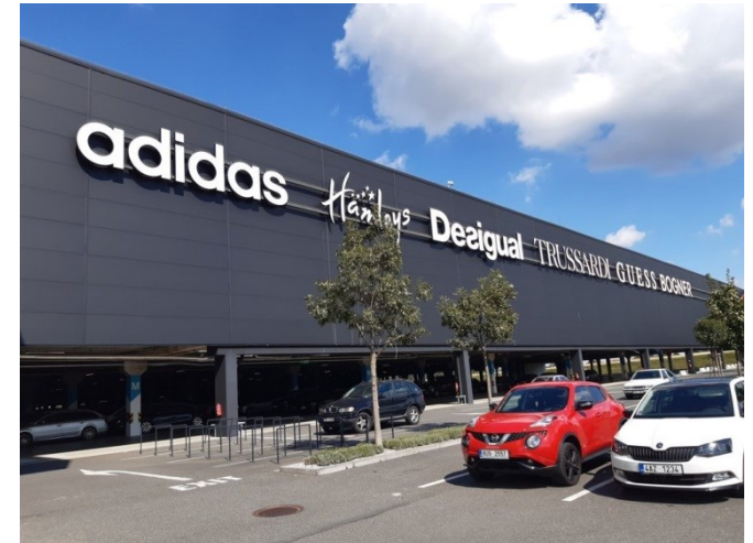
Premium Outlet Prague Airport, Ruzyně (CZ) The Prague Outlet One a.s.