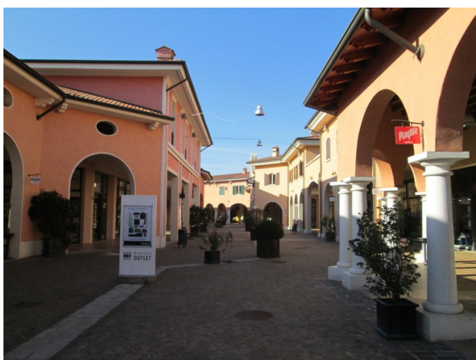
Mantova Outlet Village, Bagnolo San Vito (I) Multi Outlet Management Italy