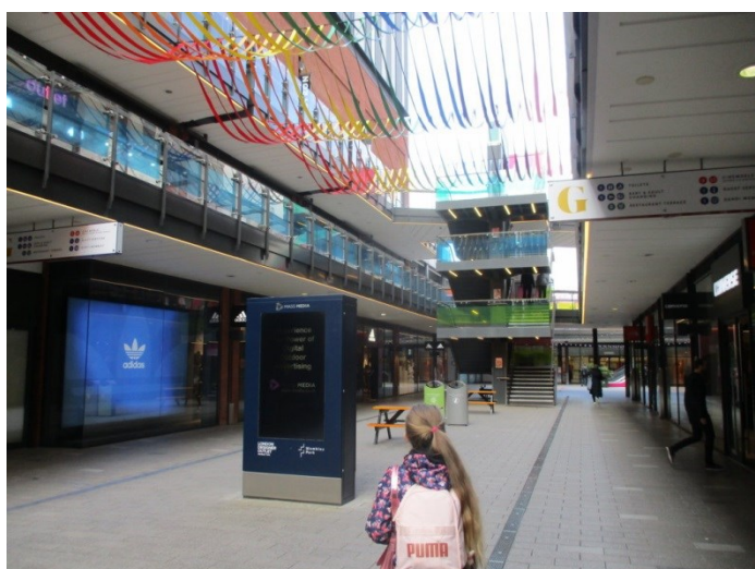
London Designer Outlet, London (UK) Realm Outlet Centre Management