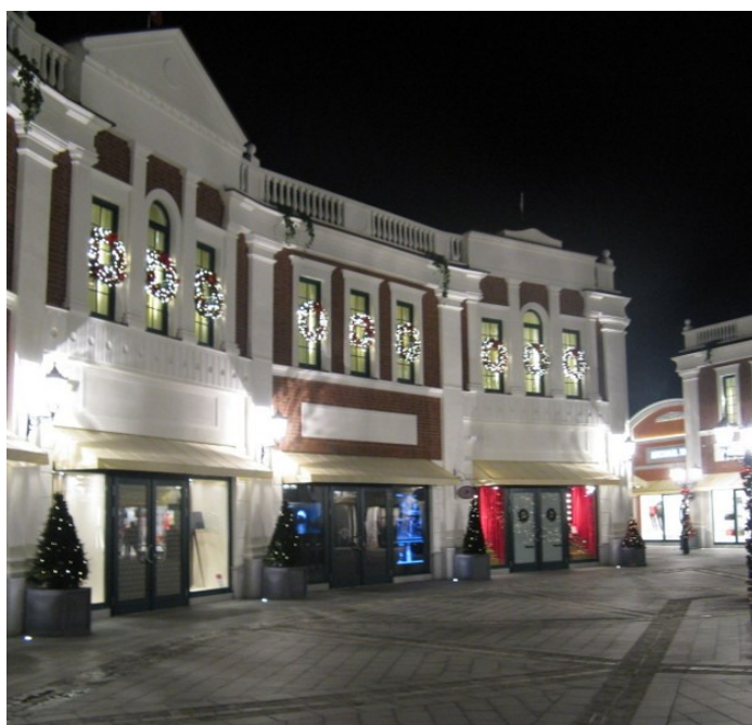
Designer Outlet Neumünster, Neumünster (D) McArthurGlen