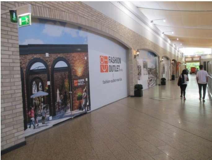
Fashion Outlet Marl, Marl (D) Outlet Evolution Services