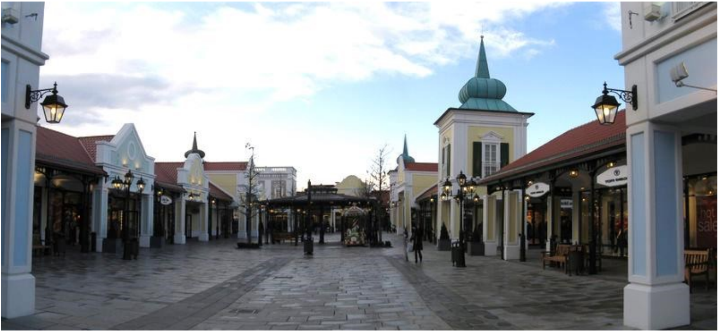
Designer Outlet Parndorf, Parndorf (A) McArthurGlen