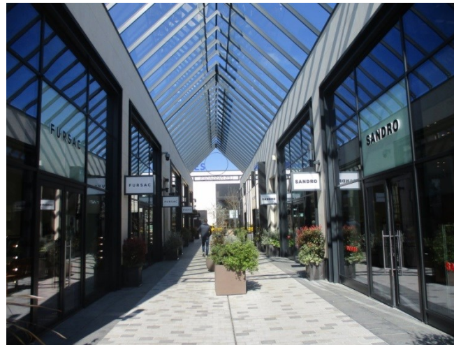
Designer Outlet Paris-Giverny, Douains (F) McArthurGlen