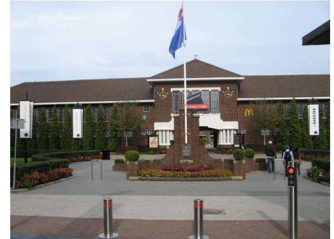
Roermond Designer Outlet, Roermond (NL) McArthurGlen