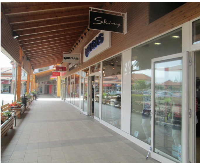
Premier Outlet Center, Batorbagy (HU) ROS Retail Outlet Shopping