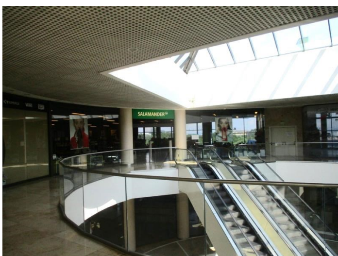
Sofia Outlet Center, Sofia (BG) Operator unknown