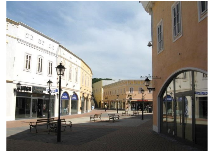
Roses Designer Outlet, Sveti Kriz Zacrctje (HR) Roses Values