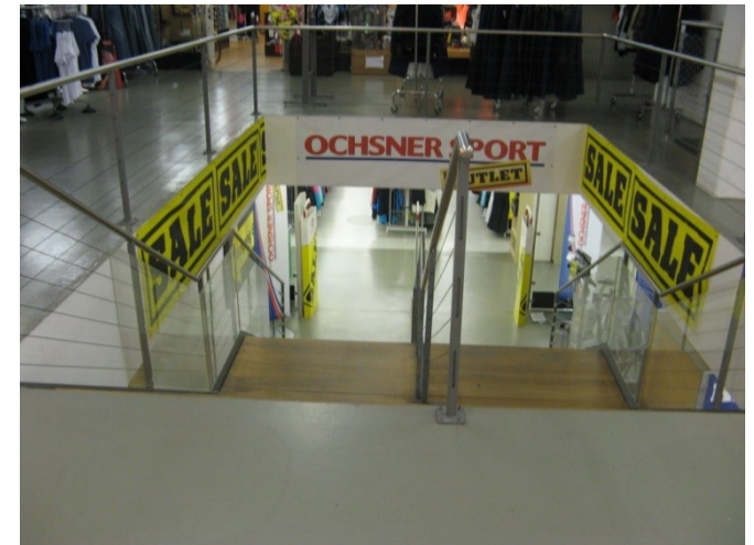
Outletpark Switzerland, Murgenthal (CH) Interdomus AG