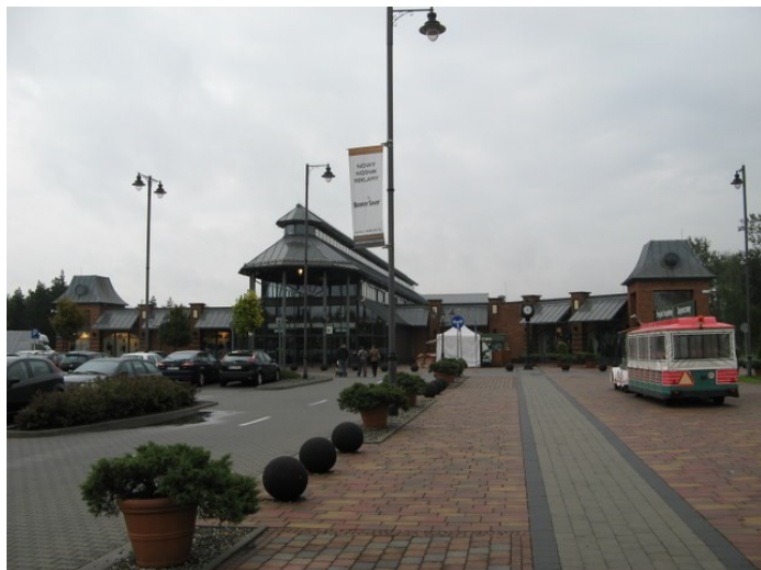
Designer Outlet Sosnowiec, Sosnowiec (PL) ROS Retail Outlet Shopping