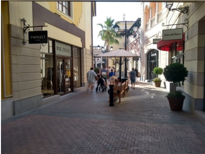
Designer Outlet Malaga, Malaga (E) McArthurGlen