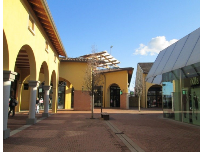
Castel Guelfo di Bologna The Style Outlets, Castel Guelfo (I) Neinver