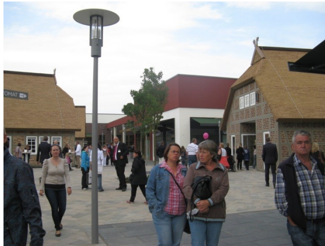
Designer Outlet Soltau, Soltau (D) ROS Retail Outlet Shopping