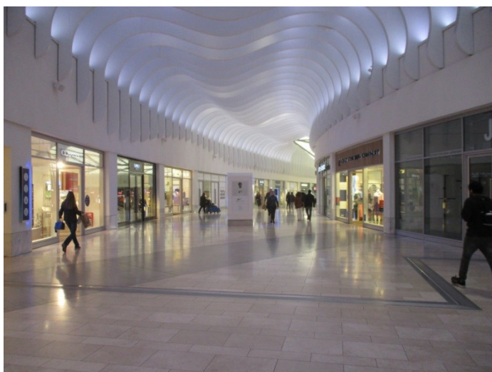
ICON Outlet at the O2, London (UK) CBRE Management