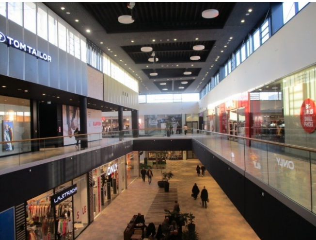
HUMA Shopping & Outlet, St. Augustin (D) Haslinger Retail Real Estate Consulting