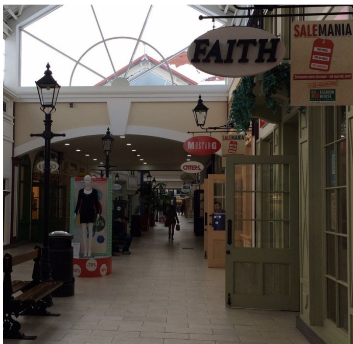
Fashion House Outlet Centre Bucharest, Bucharest (RO) Fashion House Outlet Management