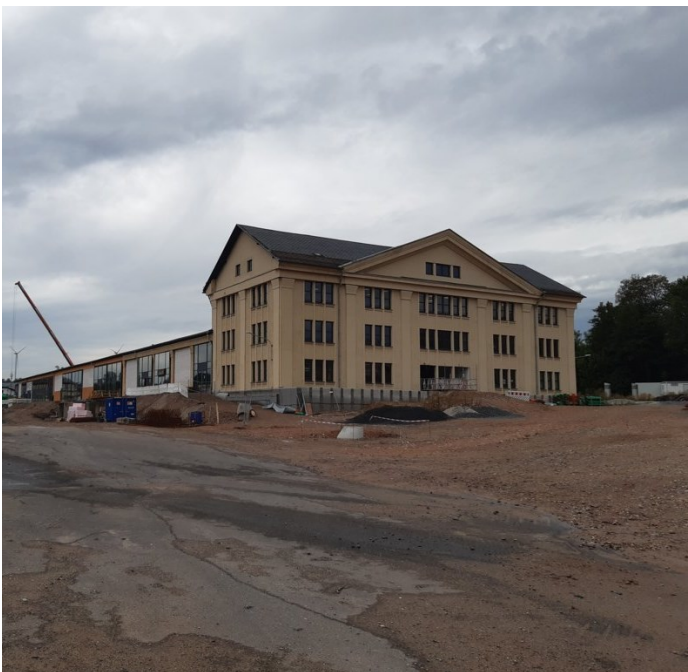
Outlet Center Selb, Selb (D) CMR Center Management Group