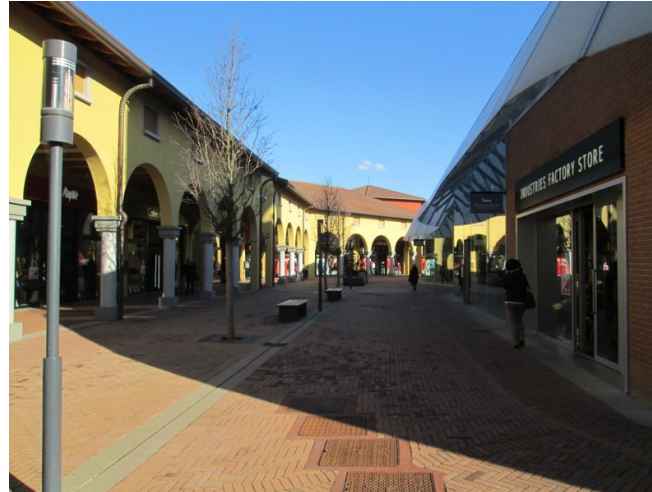
Castel Guelfo di Bologna The Style Outlets, Castel Guelfo (I) Neinver