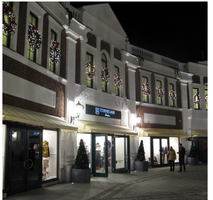
Designer Outlet Neumünster, Neumünster (D) McArthurGlen