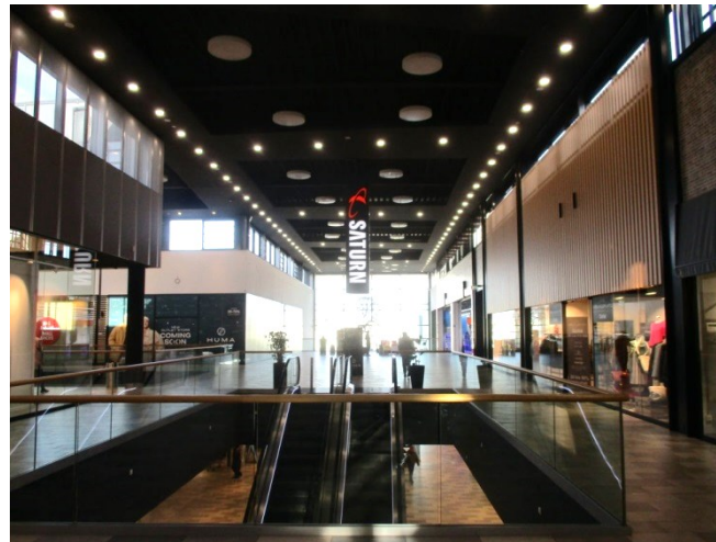
HUMA Outlet, St. Augustin (D) Haslinger Retail Real Estate Consulting