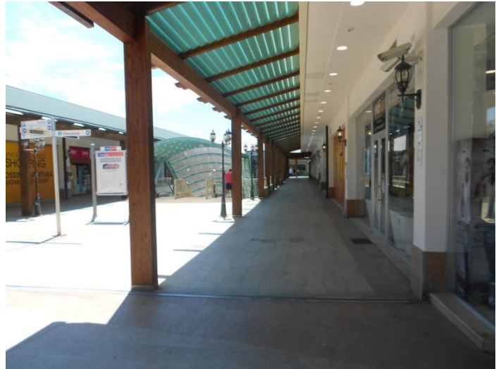
Sardinia Outlet, Sestu (I) Cogest Retail Ltd