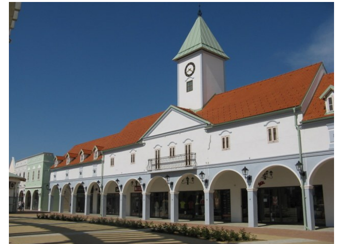
Roses Designer Outlet, Sveti Kriz Zacetje (HR) Roses Values