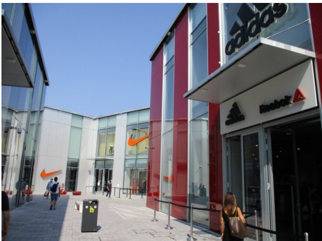
Scalo Milano Outlet & more, Locate di Triulzi (I) Locate District Spa