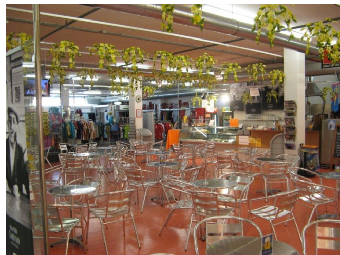
Outletpark Switzerland, Murgenthal (CH) Interdomus AG