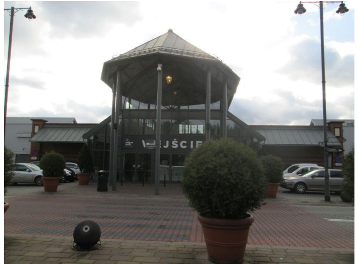
Designer Outlet Sosnowiec, Sosnowiec (PL) ROS Retail Outlet Shopping