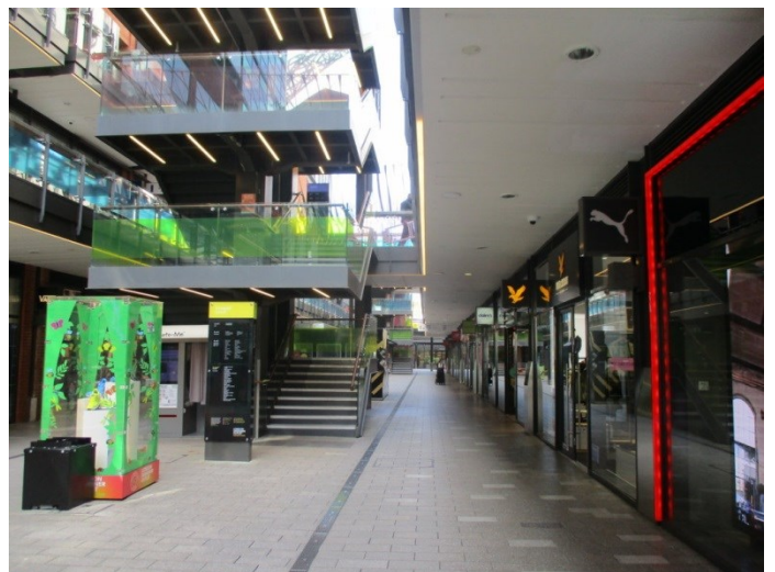
London Designer Outlet, London (UK) Realm Outlet Centre Management