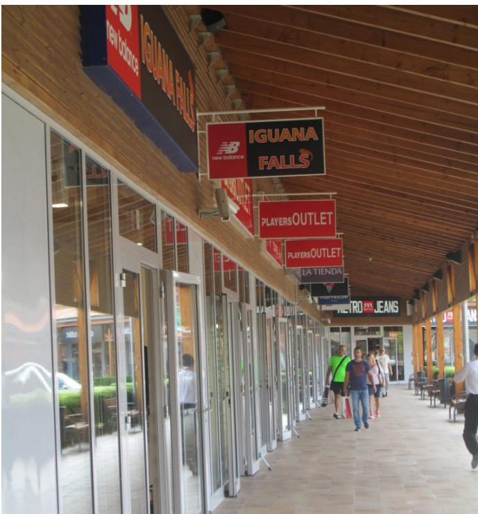
Premier Outlet Center, Batorbagy (HU) ROS Retail Outlet Shopping