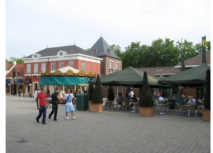
Roermond Designer Outlet, Roermond (NL) McArthurGlen