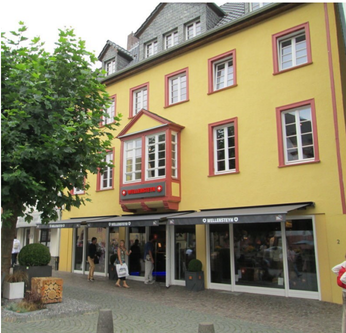
City Outlet Bad Münstereifel, Bad Münstereifel (D) City Outlet Bad Münstereifel GmbH (this picture was taken before the destruction by the flood disaster of Juli 2021)