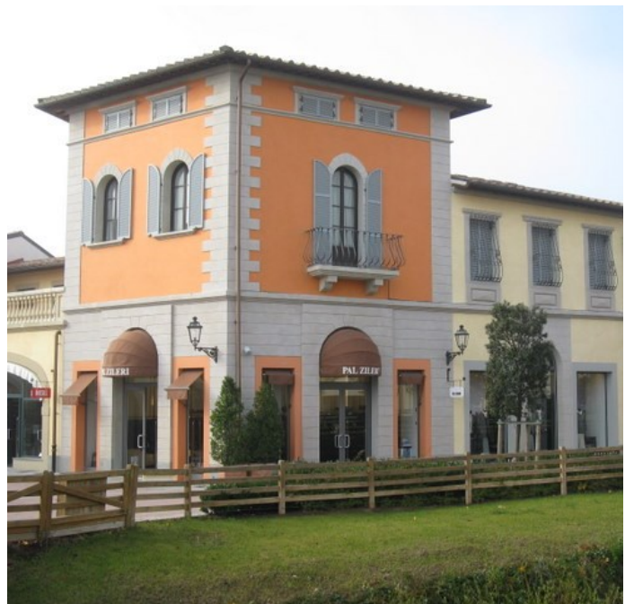
Designer Outlet Barberino, Barberino di Mugello (I) Promos