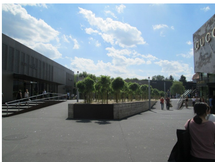
Outletcity Metzingen, Metzingen (D) Outletcity AG