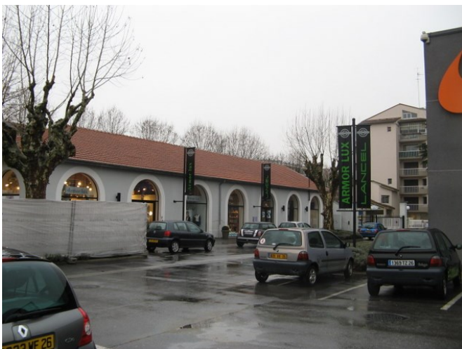
Marques Avenue Romans, Romans sur Isère (F) Marques Avenue Group