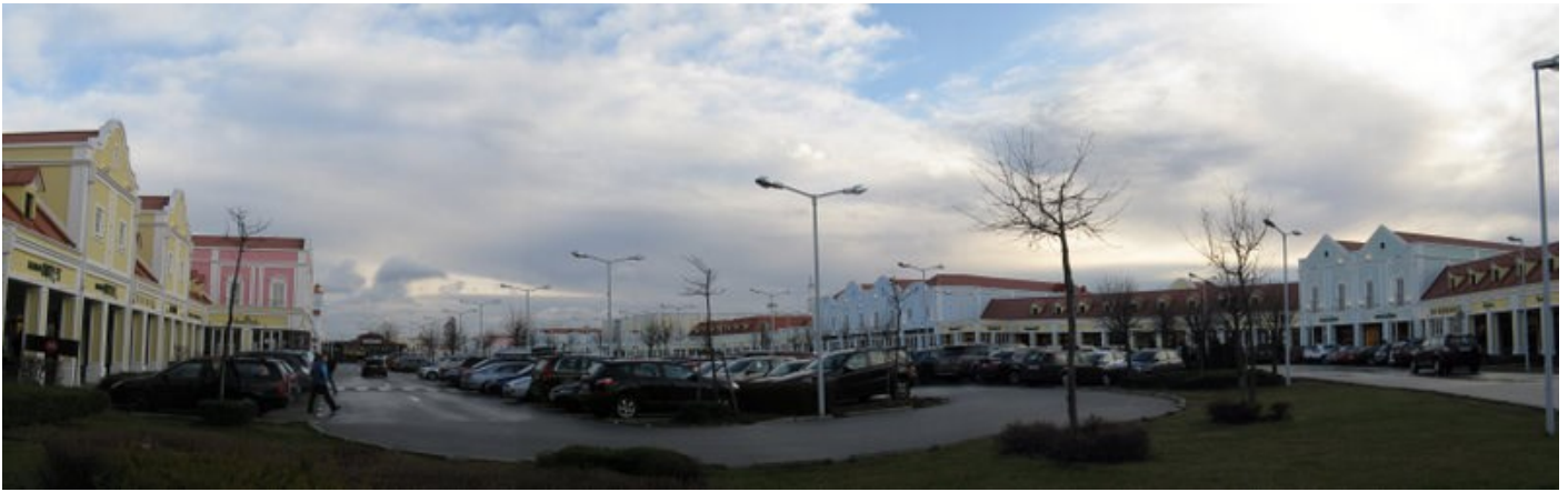
Designer Outlet Parndorf, Parndorf (A) McArthurGlen