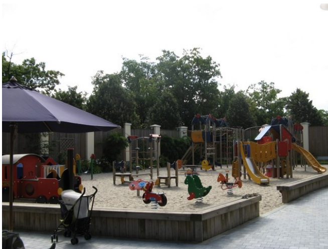
Maasmechelen Village, Maasmechelen (B) Value Retail