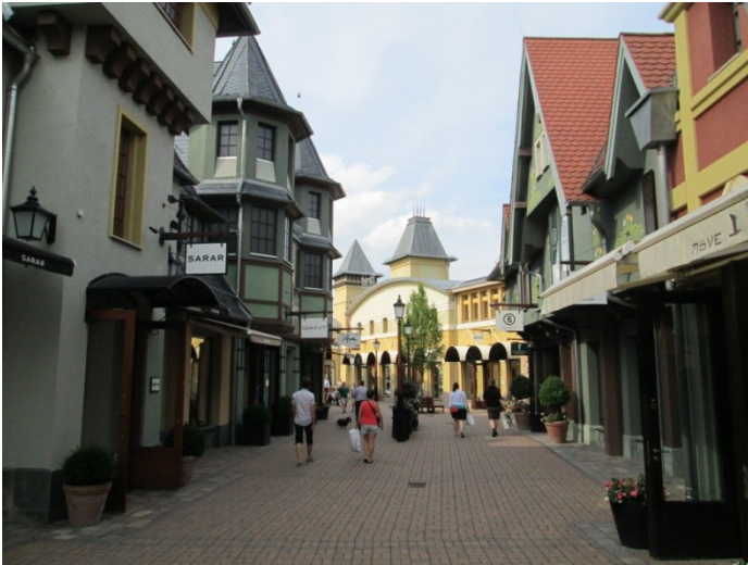
Wertheim Village, Wertheim (D) Value Retail