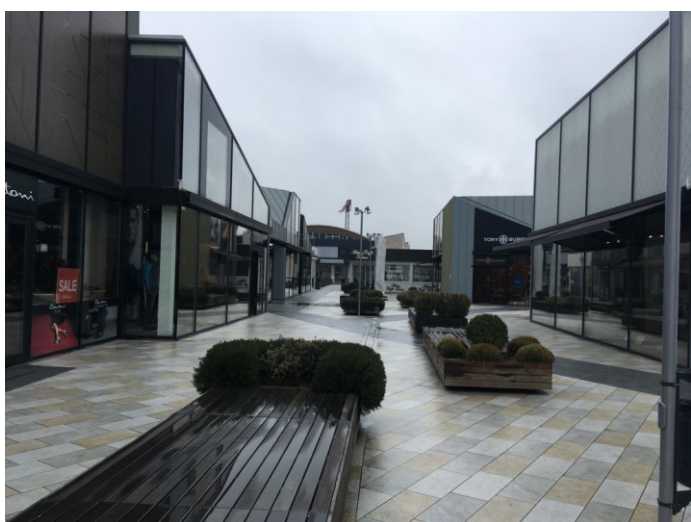
The Mall, Leccio Reggello (I) Design Management Srl