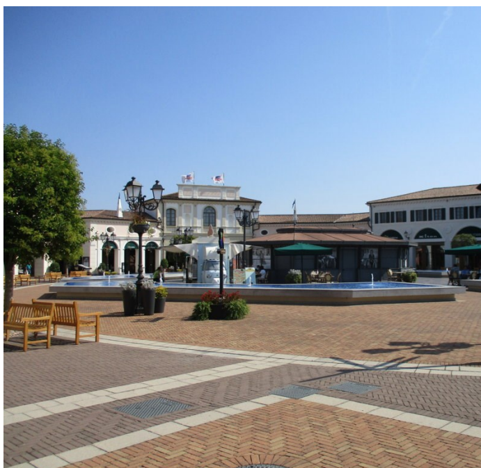
Designer Outlet Noventa, Noventa di Piave (I) McArthurGlen