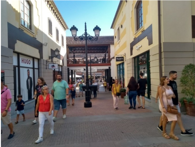
Designer Outlet Malaga, Malaga (E) McArthurGlen