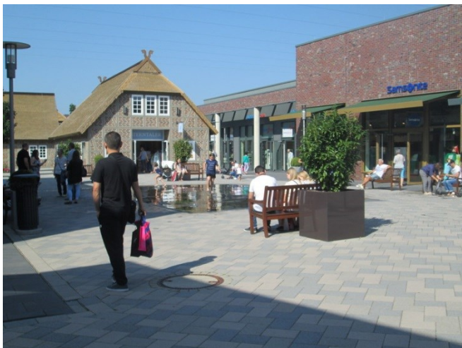
Designer Outlet Soltau, Soltau (D) ROS Retail Outlet Shopping