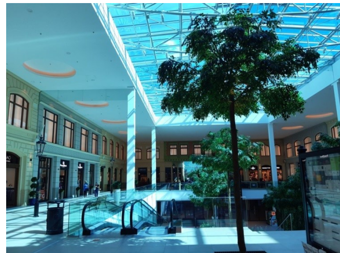
Premium Outlet Prague Airport, Ruzyně (CZ) The Prague Outlet One a.s.