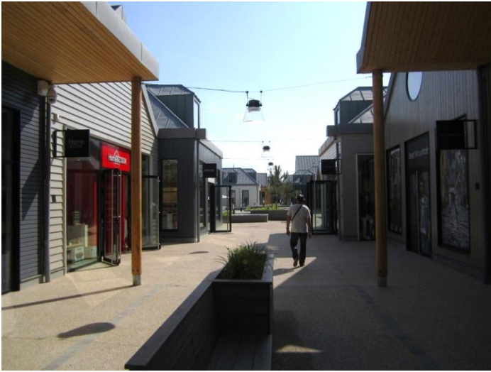
Marques Avenue A13, Aubergenville (F) Marques Avenue Group