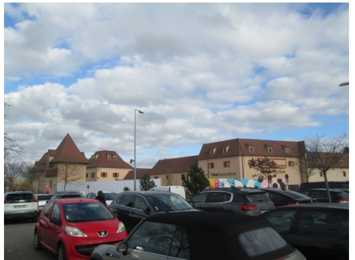
Roppenheim The Style Outlets, Roppenheim (F) Neinver