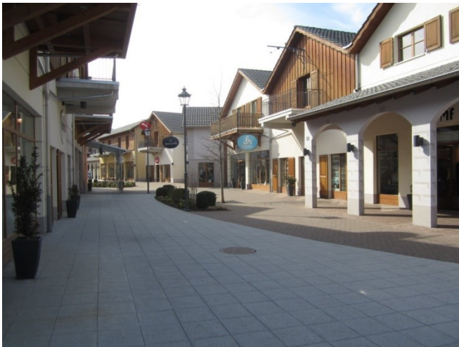
Fashion Outlet Landquart, Landquart (CH) VIA Outlets