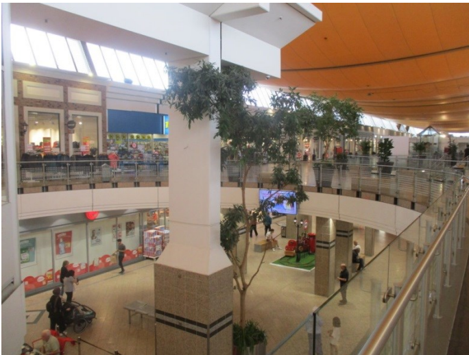
Fashion Outlet Marl, Marl (D) Outlet Evolution Services