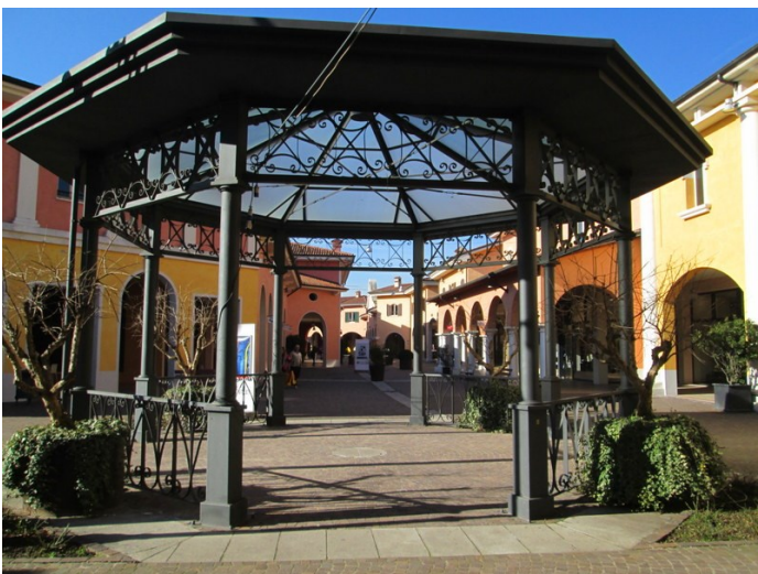
Mantova Outlet Village, Bagnolo San Vito (I) Multi Outlet Management Italy