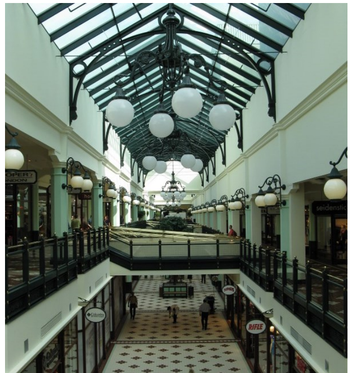
Designer Outlet Salzburg, Wals-Siezenheim (A) McArthurGlen