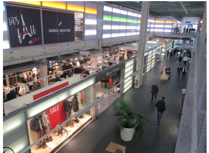
Seemaxx Outlet Center, Radolfzell (D) Kintyre Investments