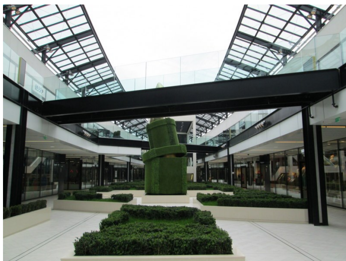
One Nation Paris, Les Clayes sous Bois (F) Catinvest