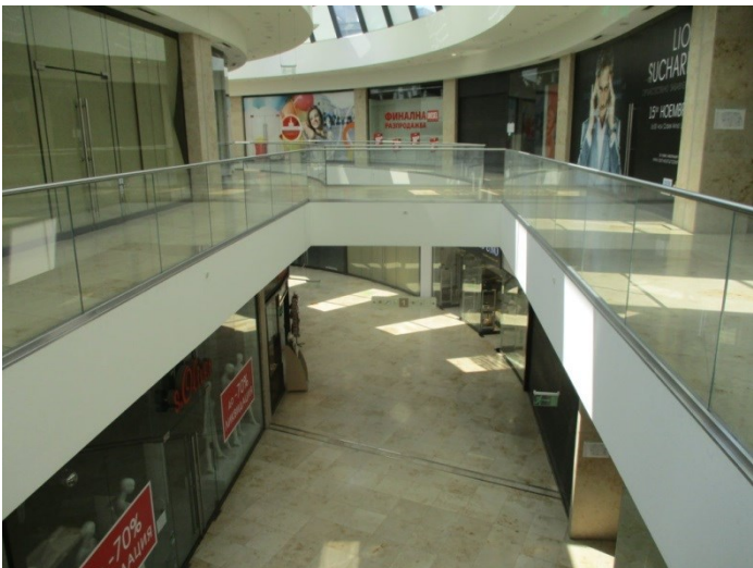
Sofia Outlet Center, Sofia (BG) Operator unknown